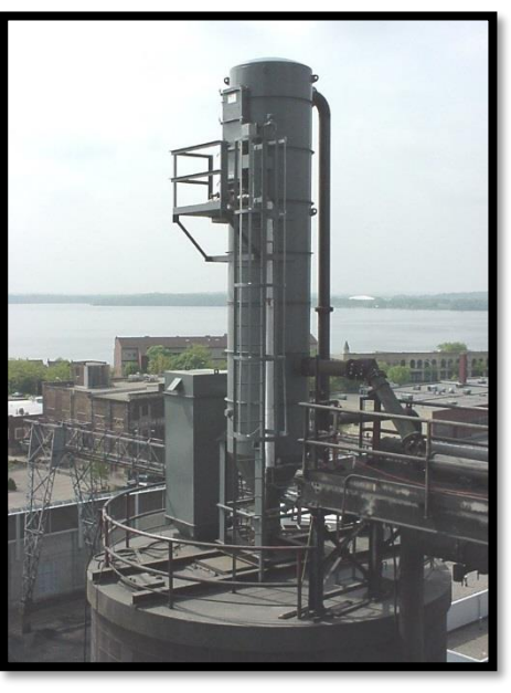
Silo Roof mounted Collector Filter

Vacuum systems can be used to unload railcars and trucks, transfer product from bins, silos, hopper, pulse jet fabric filters, ESP hoppers or any collection point (or pick up point).