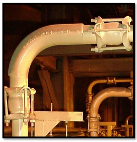
PWERMA/flo Conveying Piping