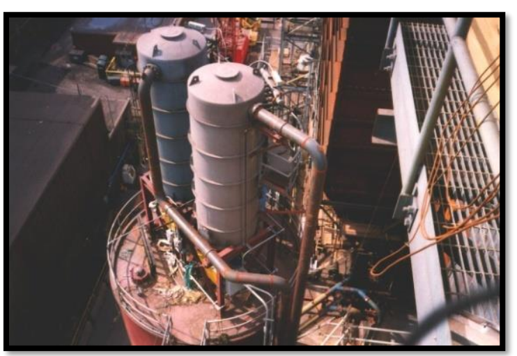
Vacuum Collector/Filters on a silo roof