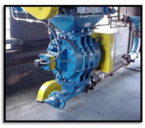
XL Rotary Valve feeding a vacuum conveying line at a pick-up point

With products and technology dating back to 1921, Delta Ducon provides equipment and full systems for the material handling industry.