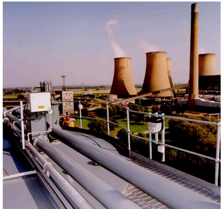
Pneumatic Fly Ash System