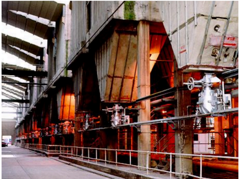
Ash Vessel Coarse Ash Handling System