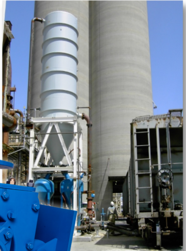
Rail & Truck Unloading