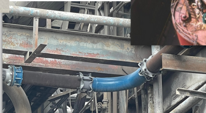
PERMA/flo Abrasion Resistant Equipment