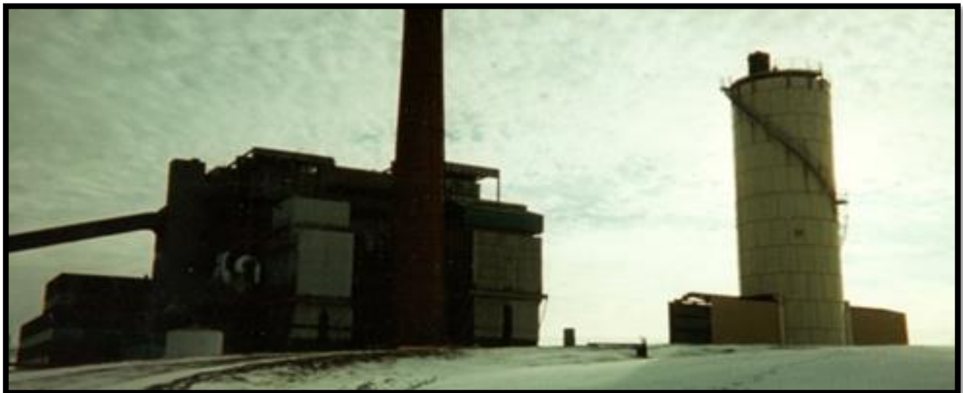
Long Distance Conveying & Storage

DELTA DUCON, LLC 35 Sproul Road, Malvern, PA 19355 Phone: 610.695-9700 - Fax: 610.695.9724 www.deltaducon.com