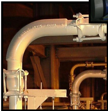
Abrasion Resistant Equipment