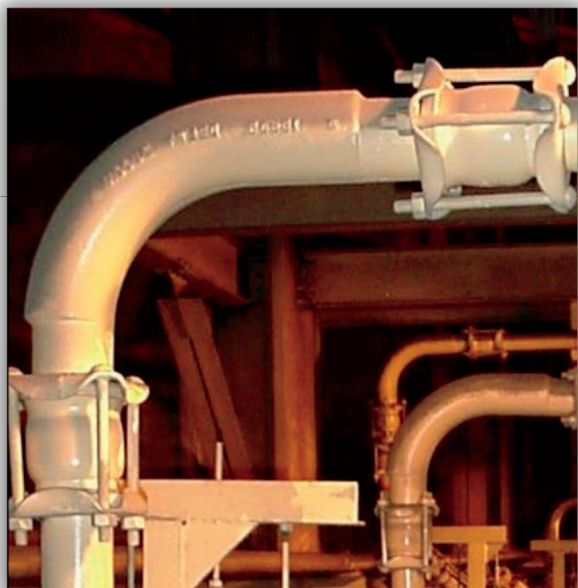
Ash Conveying Piping