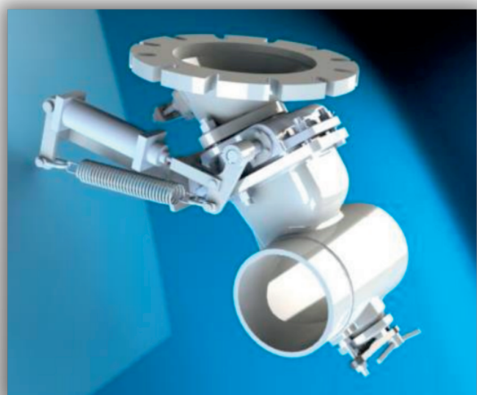
Ash Intake Valves