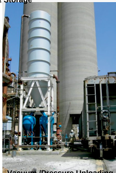
Vacuum /Pressure Unloading