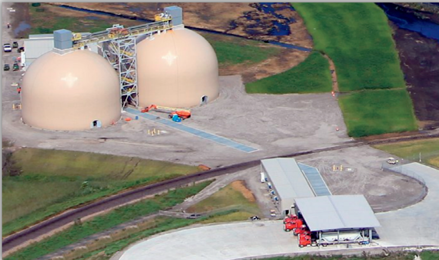
Long Distance Unloading, Conveying & Storage