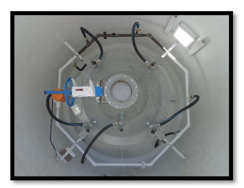
Conical Silo Pulse Pad Aeration

DELTA DUCON, LLC 35 Sproul Road, Malvern, PA 19355 Phone: 610.695-9700 - Fax: 610.695.9724 www.deltaducon.com