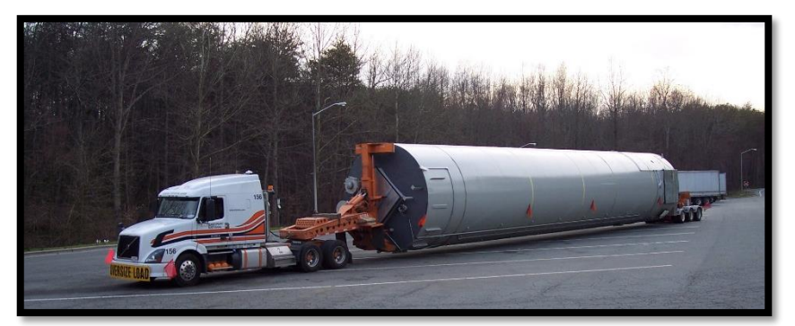
Shop Welded, One Piece Silos