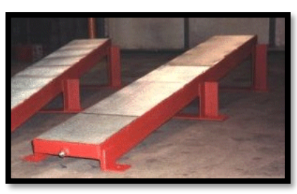
Flat Bottom Silo Aeration Trays