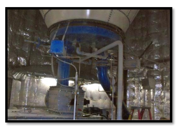
Conical Silo Aeration Bottom