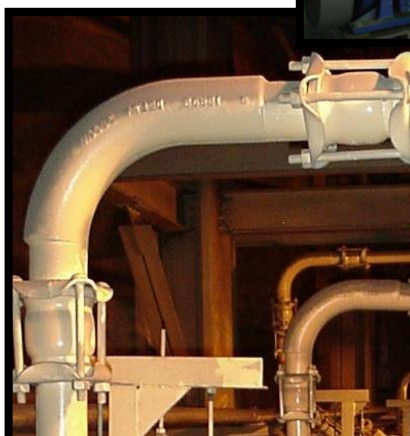
Abrasion Resistant Equipment