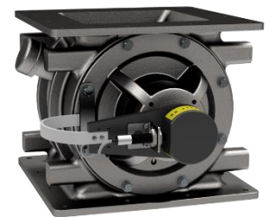
Shaft Zero Speed Switch