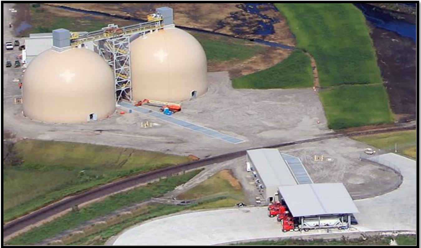
Long Distance Unloading, Conveying & Storage