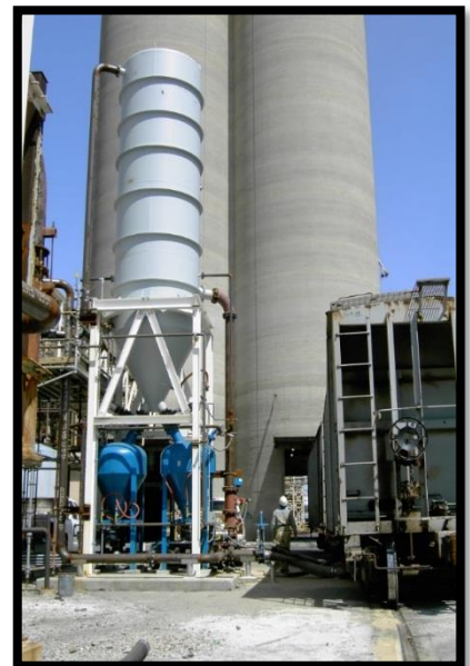
Vacuum /Pressure Unloading