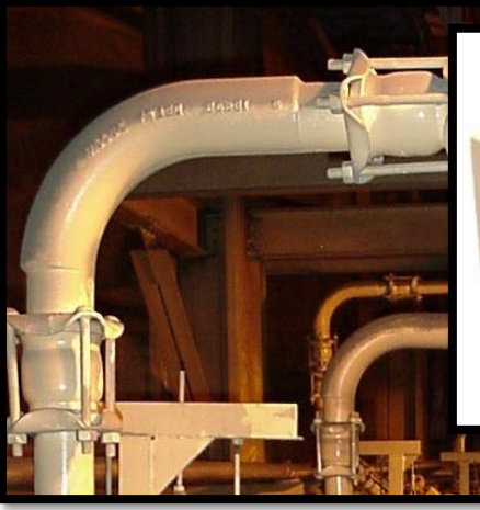
Abrasion Resistant Equipment