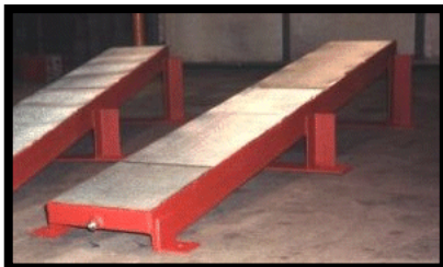
Flat Bottom Silo Aeration Trays