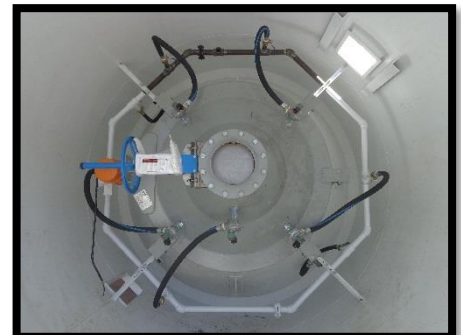
Conical Silo Pulse Pad Aeration

DELTA DUCON, LLC 35 Sproul Road, Malvern, PA 19355 Phone: 610.695-9700 - Fax: 610.695.9724 www.deltaducon.com