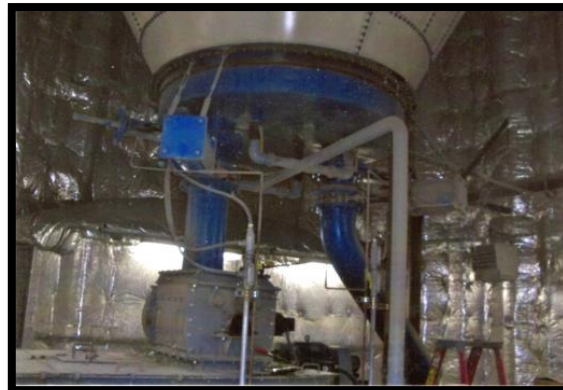
Conical Silo Aeration Bottom