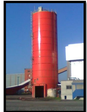
Field Bolted Silos