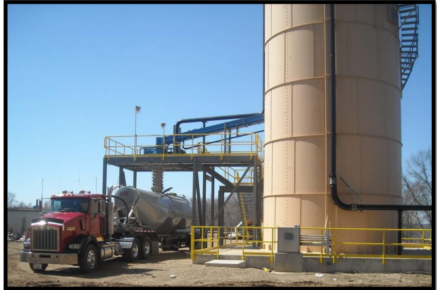
Air Slide Conveying to Dry Silo Unloading Spout