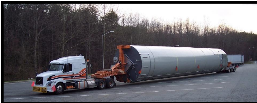
Shop Welded, One Piece Silos