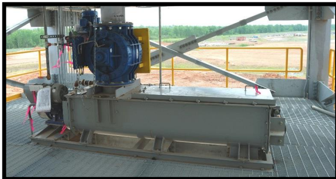
Pugmill Mixer / Conditioner Unloader

Material Storage Silos and Unloading Equipment are integral parts of a material handling system. Delta Ducon can design and supply storage silos, silo aeration and wet and dry silo unloading equipment that will meet the specific size and needs of the customer's application.