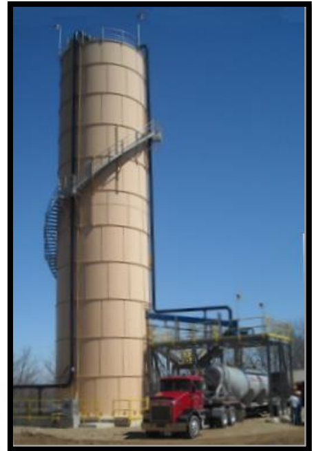
Silo Aeration & Unloading