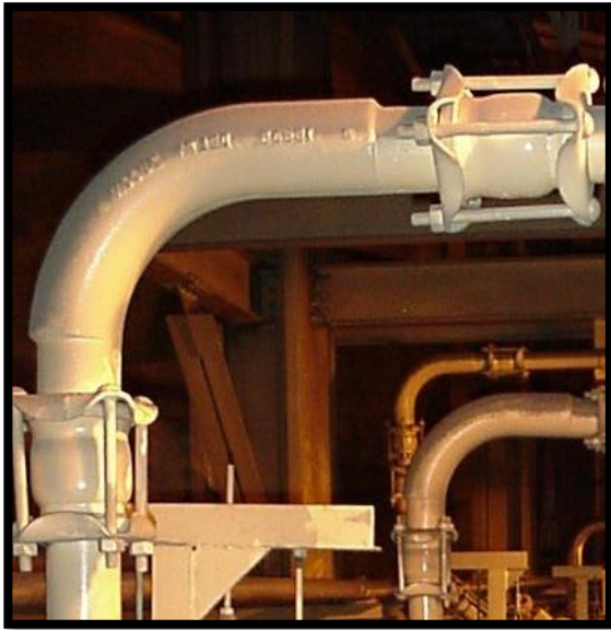
Ash Conveying Piping