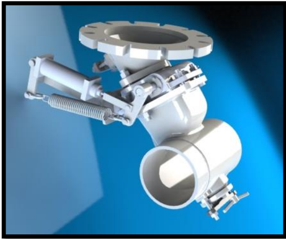
Ash Intake Valves